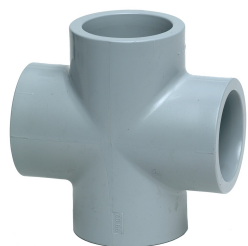
Крестовина, PVC-C метрическая